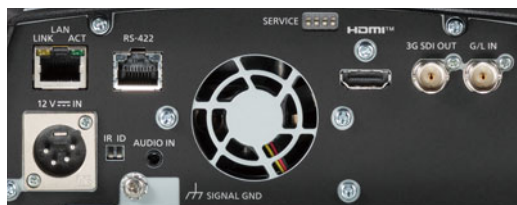
* Abbreviation of Power over Ethernet Plus Plus. Conforms to IEEE802.3bt.