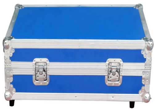
Flight Transport Case