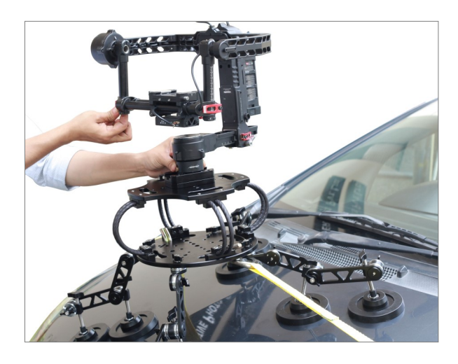
NOTE: Test all fixtures before driving.

• Finally, mount the DJI / Movi Gimbals (Not Included) of your choice as shown.