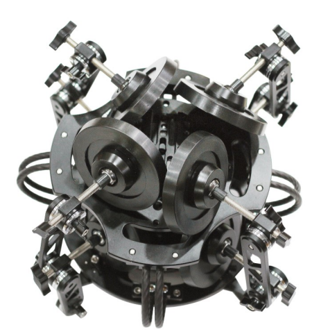
Gimbal Vibration Isolator

Note: If you have purchased (CM-GMST-01) kit, you will receive the following: